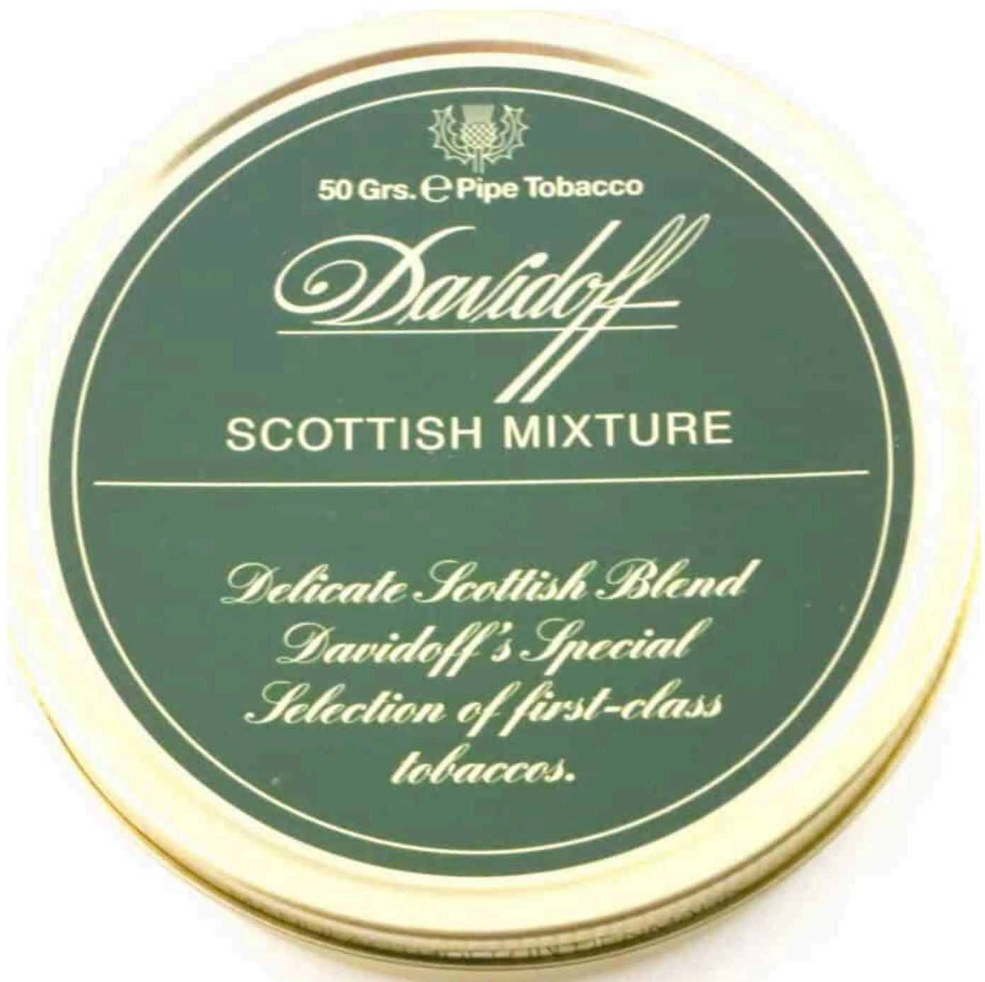
The incredible Scottish Mixture by Davidoff