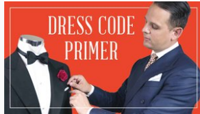
Dress Code Primer For Men & Women