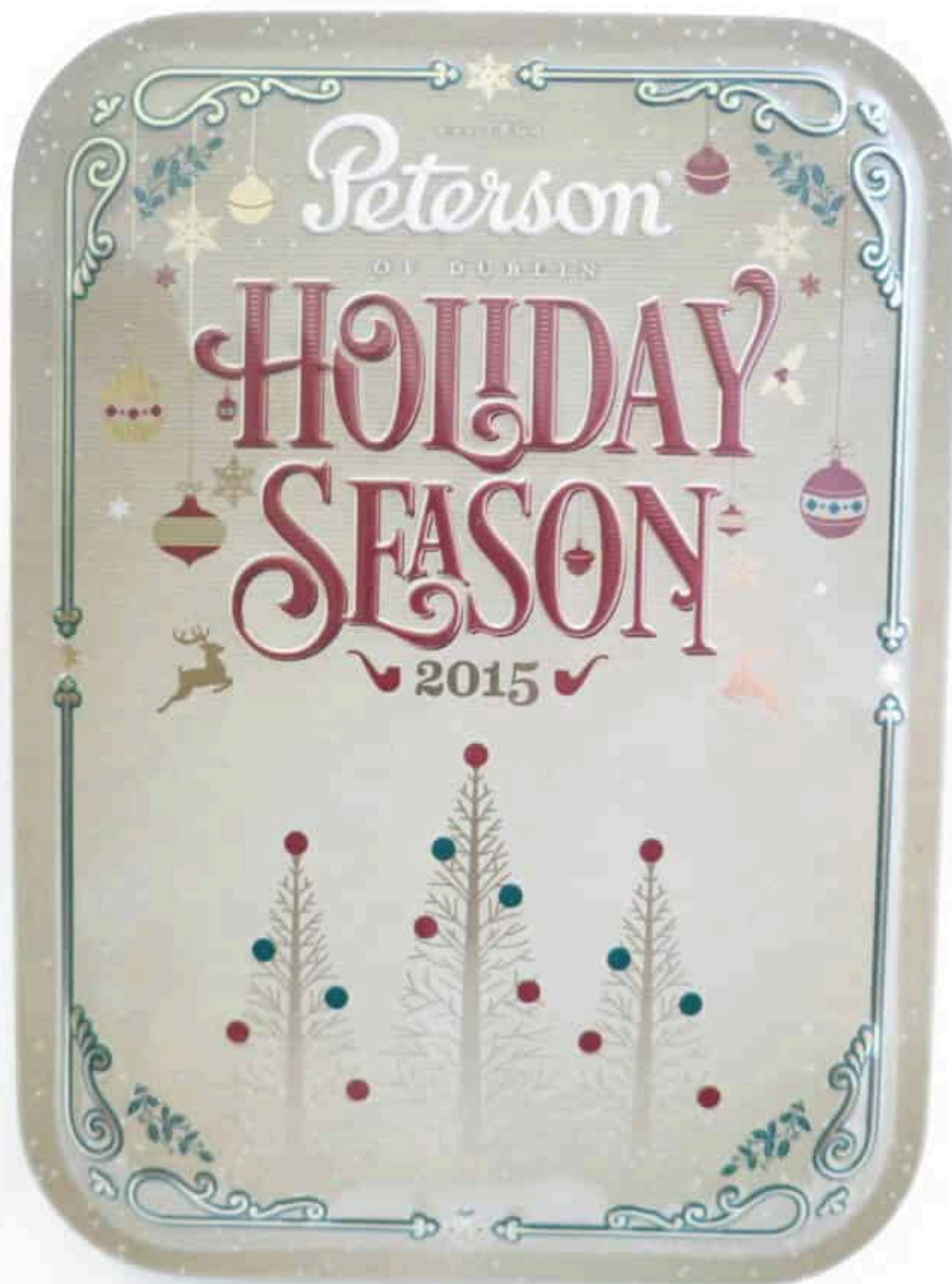
Peterson Holiday Season 2015 Pipe Tobacco

A quintessential blend of Virginia and perique tobaccos, Dunhill has once again crafted a delightfully endearing blend. At first glance, I must admit I was a tad put off by a warm tomato ketchup aroma, but once lit it wasn't overly sweet or fruit-forward as I initially expected it to be. It has a very light touch of spice but isn't overpowering in the least. The natural flavors from the Louisiana perique are still present, and the beauty of the Virginia tobacco is clear but without the bite. Overall, this is a great Dunhill tobacco that's worth trying, but it takes a refined palate to be able to appreciate its intricate flavor profile.