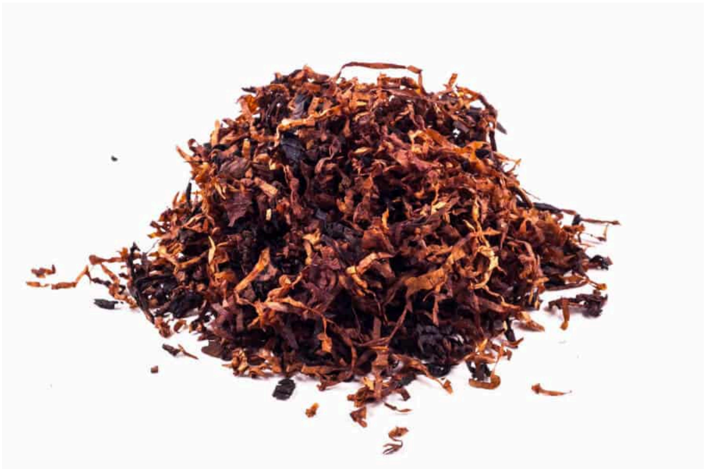
Pipe tobacco close up