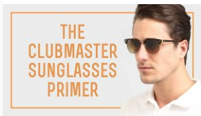
Clubmaster Sunglasses &...