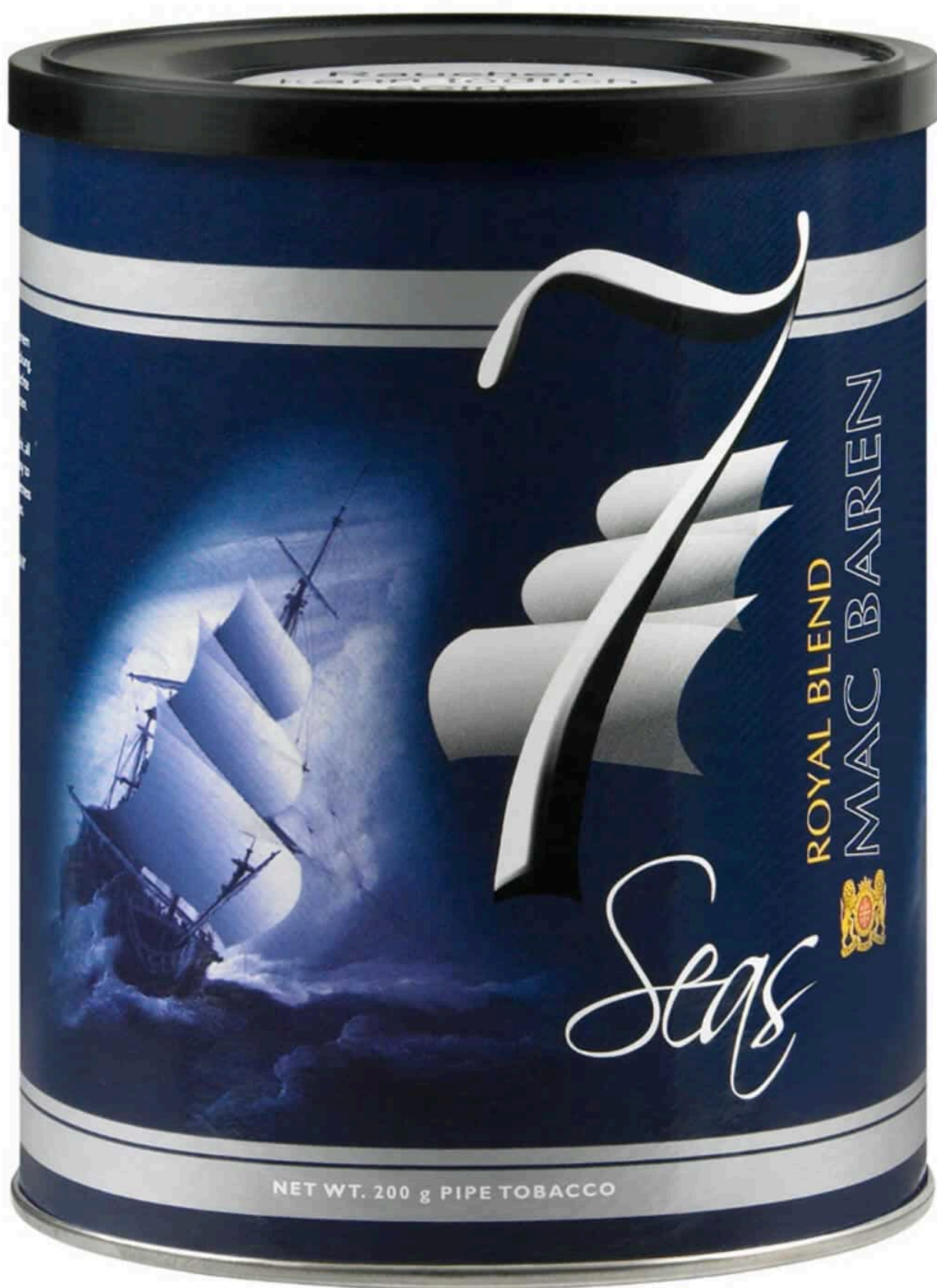
7 Seas Royal Blend