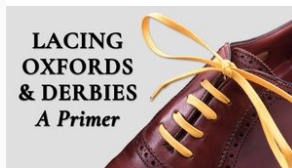
How To Lace Oxfords, Derbies, & Men's...