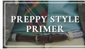
The Preppy Style & Clothes Primer