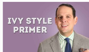
The Ivy Style Primer