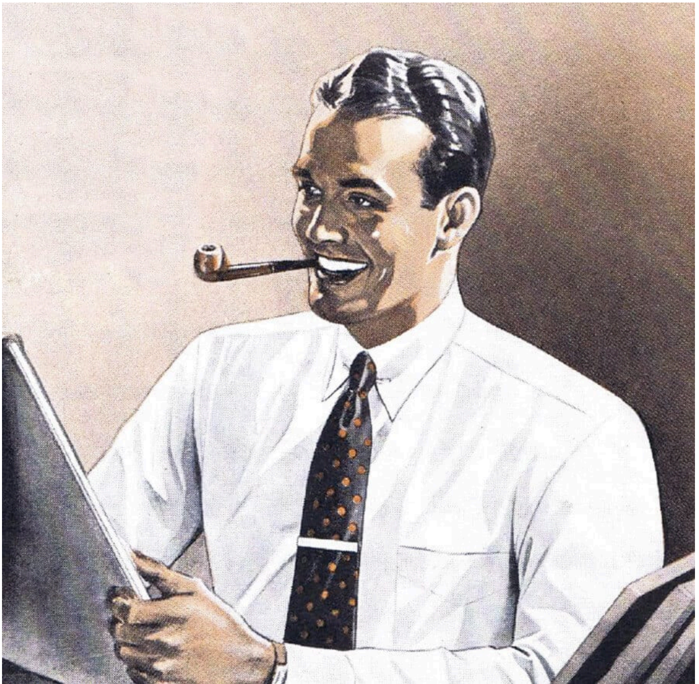
Nostalgic images of the suburban pipe smoker