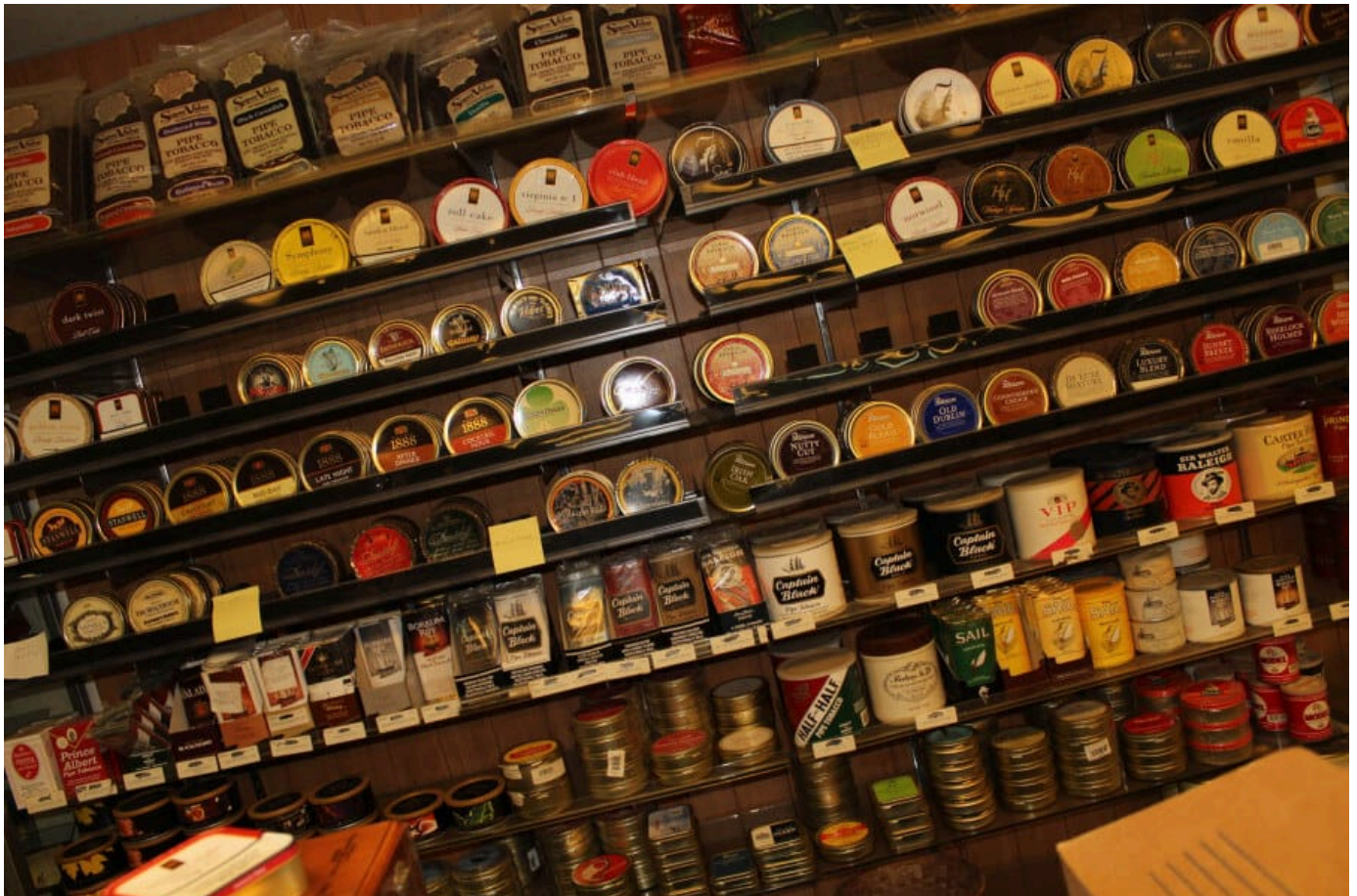
There is a huge range of pipe tobaccos available

Grown only in St. James Parish, Perique is a spiced tobacco that is fermented and cured together. Often found in Virginia blends, it's very oily with strong notes of dried fruit and black pepper.