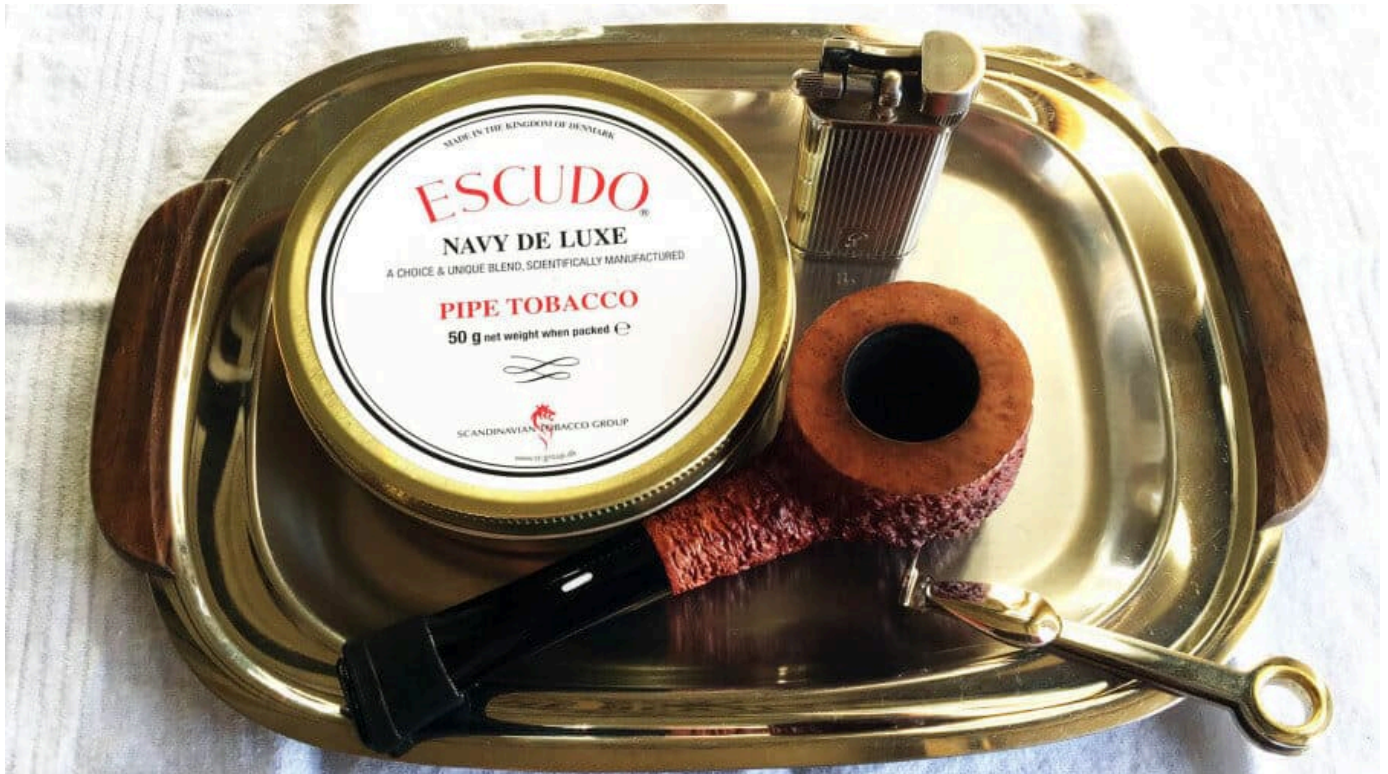
Escudo Navy De Luxe

I really love this blend of Cavendish, Virginia, burley and black cavendish tobaccos. It's rich and satisfying with hints of sherry cream and peaty whisky. It's a coarse cut that needs to be rubbed out but is truly a member of the holy trinity of aromatic tobaccos. The burst of nougat is a very nice twist that McClelland has managed to perfect. You'll enjoy this one.