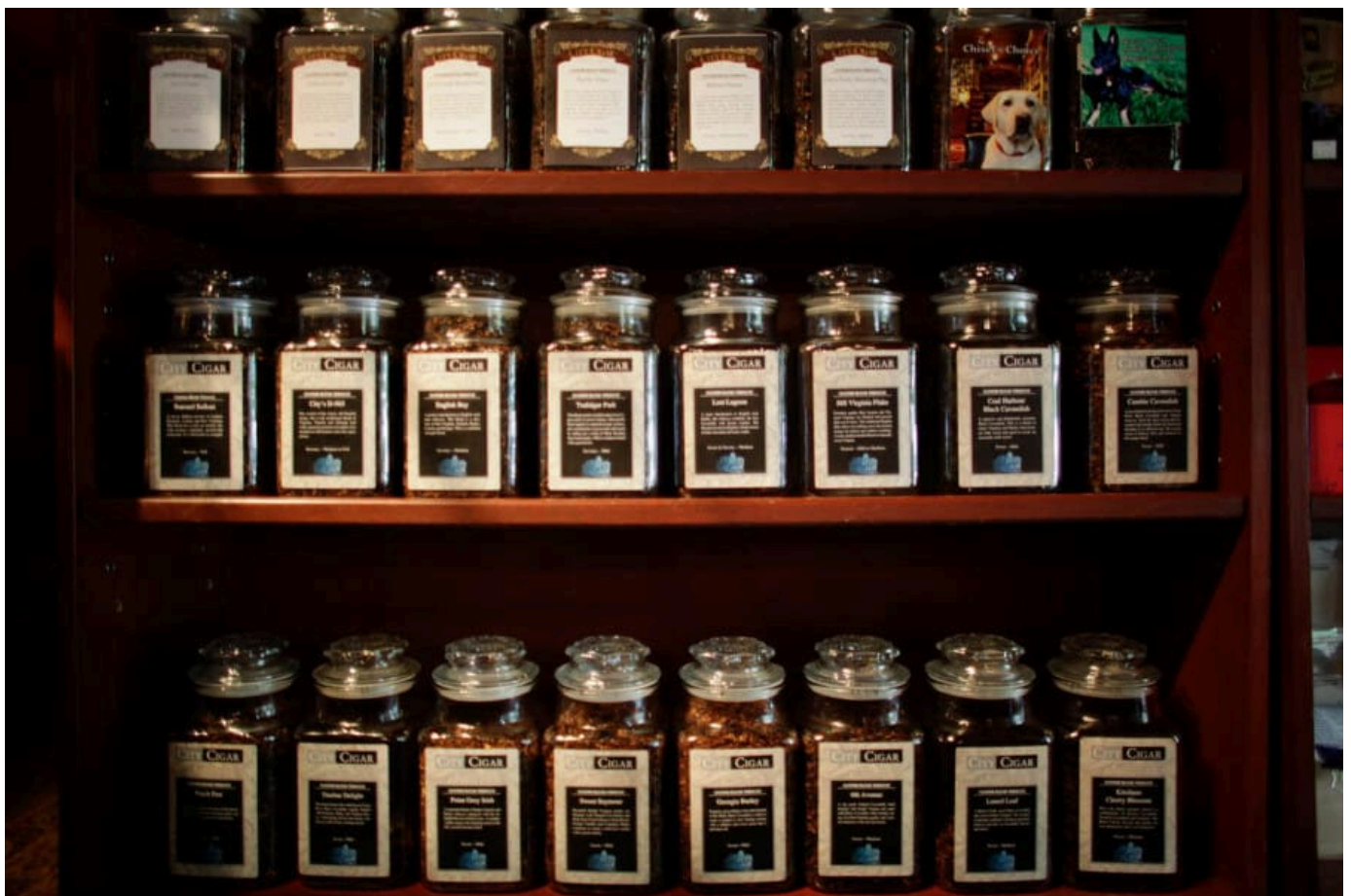
Custom house blends from a tobacconist

In my opinion, the only place worthy of your business is a reputable tobacconist. There truly is no exception, and a relationship with your tobacconist is akin to the relationship a gentleman should have with his barber or tailor. It's worth it to find a tobacconist who knows your tastes and carries a wide selection of blends to choose from. In fact, many tobacconists have house blends and some will even custom blend a batch for loyal customers.