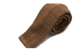
Tobacco Brown Silk Knit Tie