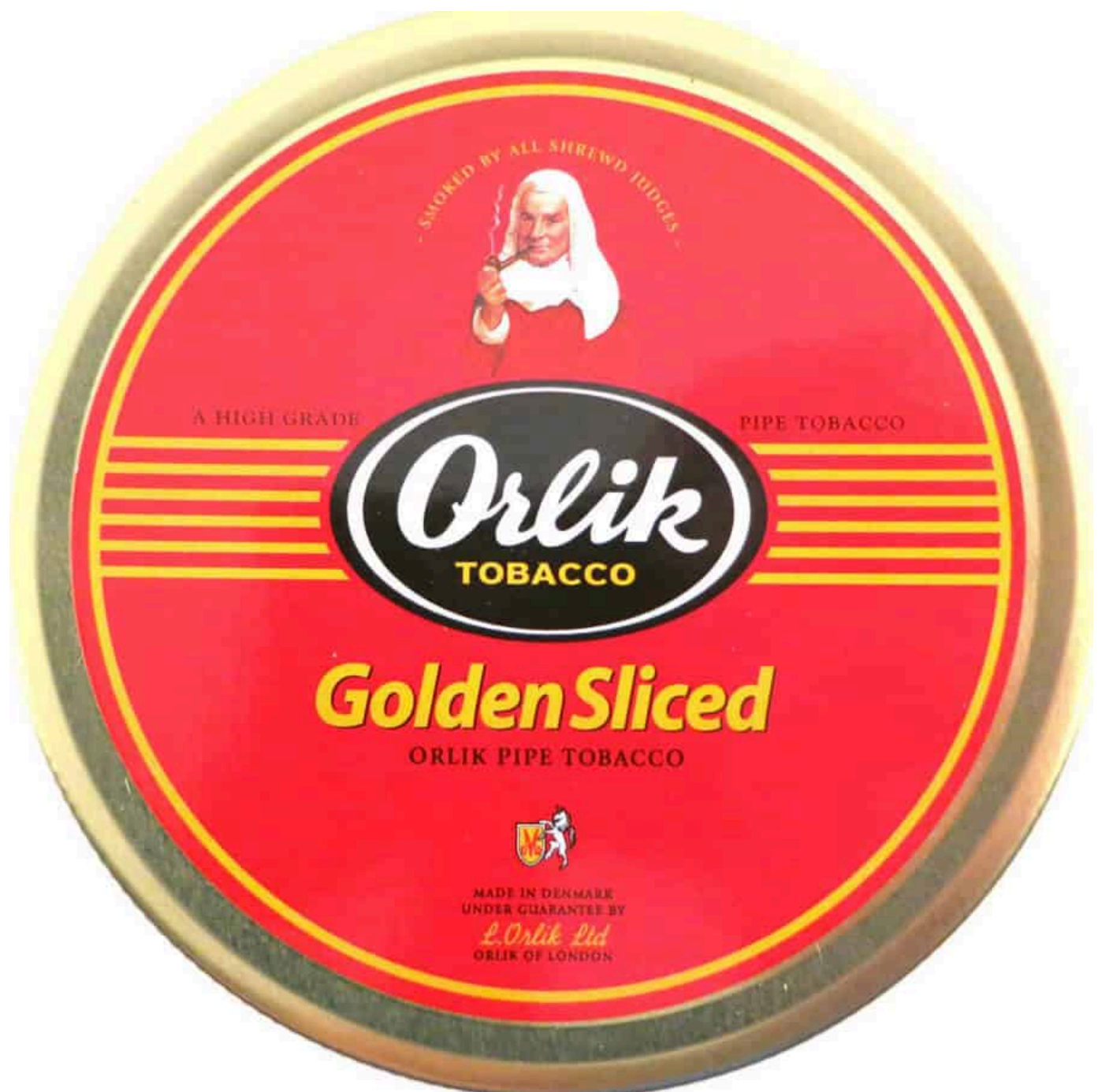
Orlik Golden Sliced